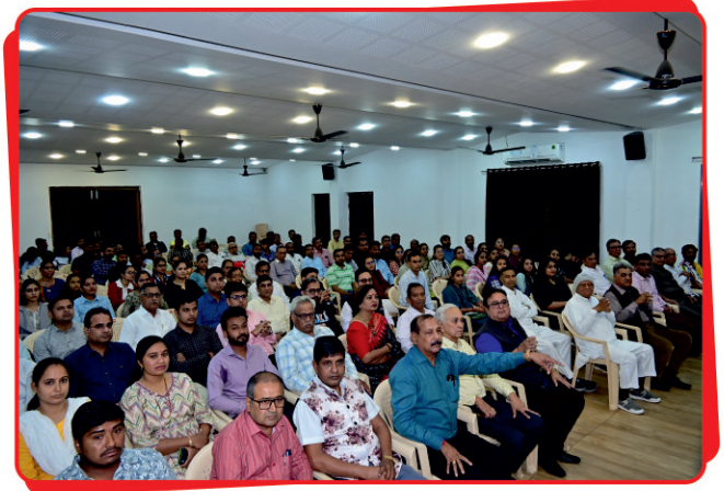
PARENT & ALUMNI MEETING