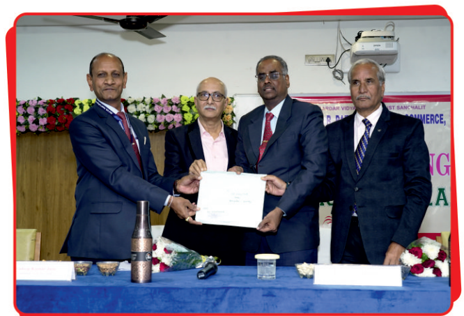
NAAC PEER TEAM REPORT DELIVERED