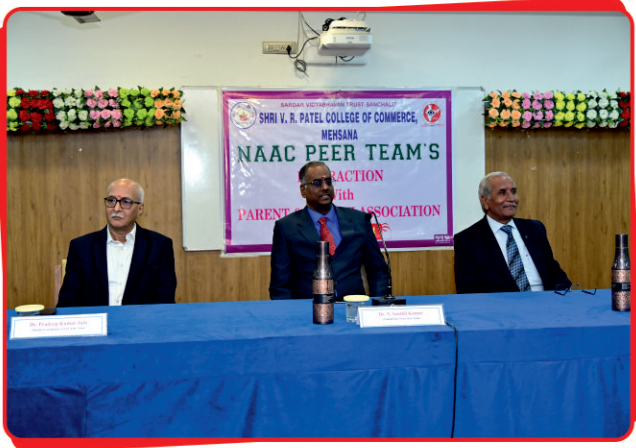
PARENT & ALUMNI MEETING