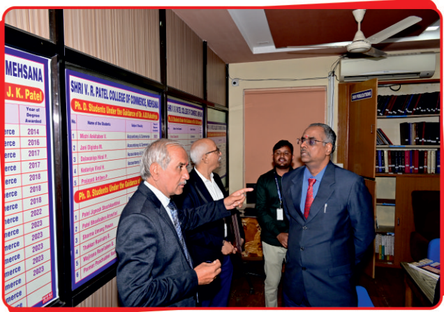
RESEARCH CELL VISIT