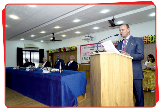
PRINCIPAL ADDRESS AT EXIT MEETING