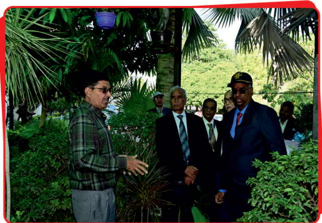
BOTONICAL GARDEN VISIT