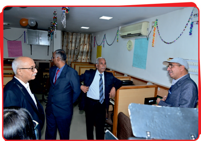
SCOPE LAB VISIT