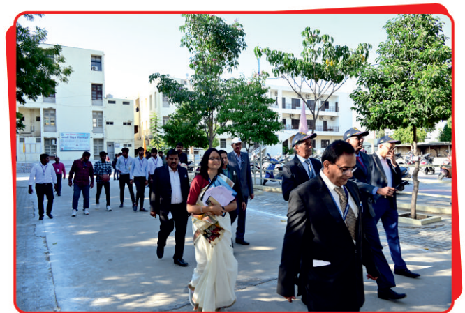
CAMPUS BIRD VIEW