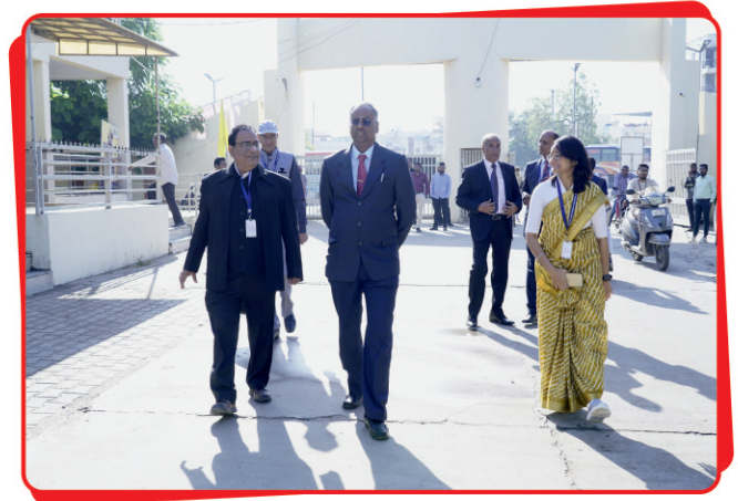
PARKING AREA VISIT