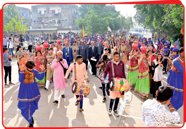
PEER TEAM TRADITIONAL WELCOME