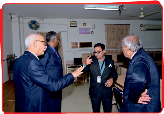
COMPUTER LAB VISIT