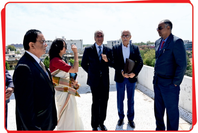
SOLAR PANEL VISIT