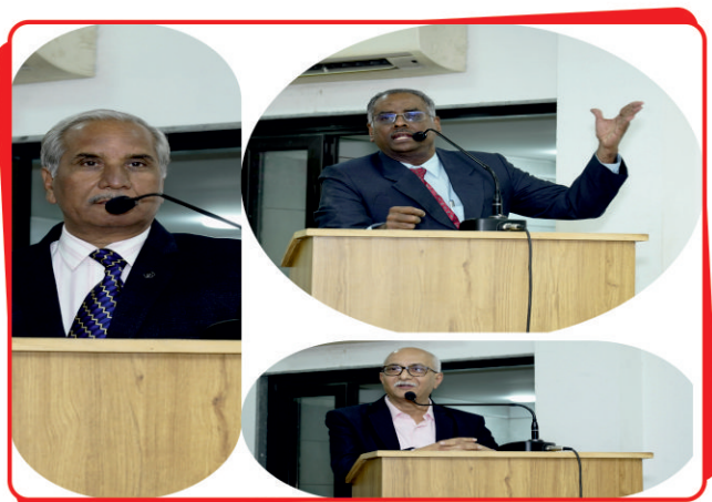
PEER TEAM CONCLUDING REMARKS