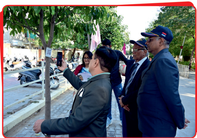
TREE QR CODE SCANNING