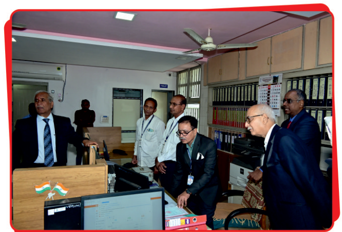
ADMIN OFFICE VISIT