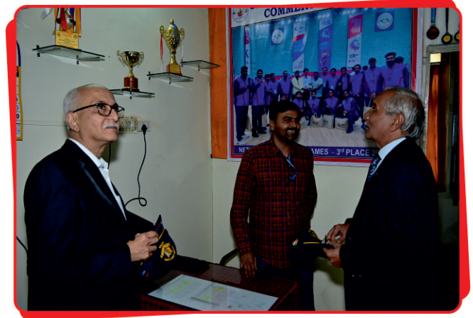
SPORTS ROOM VISIT