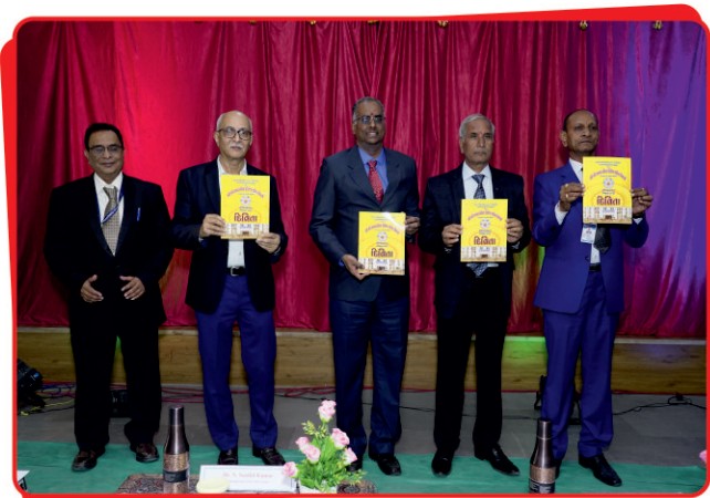
"DIVITA" LAUNCHED BY NAAC PEER TEAM